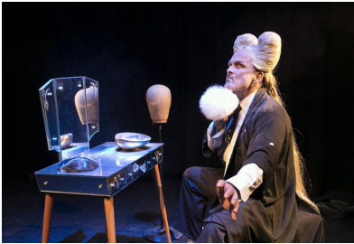
Ron Athey, Acephalous Monster , multimedia solo performance, 2018