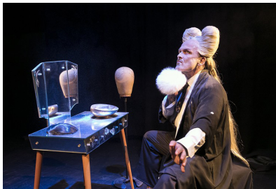
Ron Athey, Acephalous Monster , multimedia solo performance, 2018