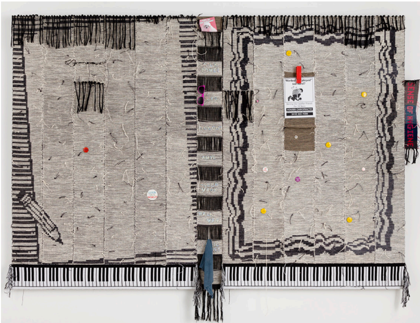
Attachments , 2016, handwoven hemp, hand bleached, hand-dyed in fashionable shades of Black and Cardinal Red, giant clothespin, trick towel, greeting card, pins, iron-on scrapbooking letters, laminated advertisement for a chiropractor, and sun glasses from a cruisy area on Venice Beach on stretched linen, 112.5 x 75.5 x 4 inches (in two parts)