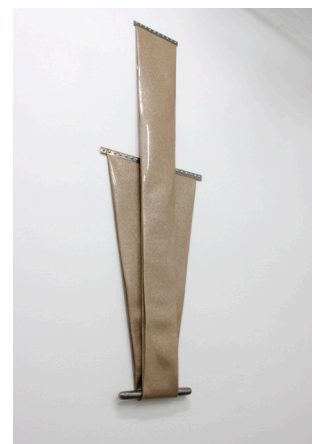
Cameron Clayborn, Untitled (Vinyl 8) , 2017, glitter vinyl, steel, upholstery nails, 20 x 72 x 2 inches

"I interrogate the stability of identity as something that is only built by the historical, social, and political constructs of our bodies – specifically the black, brown, and African-American body. I work with participants, sexual content, imagery of death, opposites, weight, and various surface treatments and textures as means to probe these constructs. The primary media of my work is sculpture, performance, video, and installation. I source my materials from physical spaces where public and private interaction collapse in one another such as; bars, night clubs, and bathhouses."