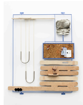
Alex Chitty, for another who isn't, but never ceases to be , 2016, powder coated steel, cork, c-print, xerox print, altered Fanta-can, cast white bronze, chromed steel, rope, maple, glass, cast brass, blush brushes, 65 x 50 x 5 inches

Alex Chitty's practice is driven by an interest in the abstraction of narrative and a curiosity for the object. Born in Miami, Florida to British parents, Chitty's background as a biologist influenced the development of a hyper observational eye towards anecdotal detail. Within the work is an inherent appreciation of the act of noticing oneself see and a desire to engage viewers with the details of the present.