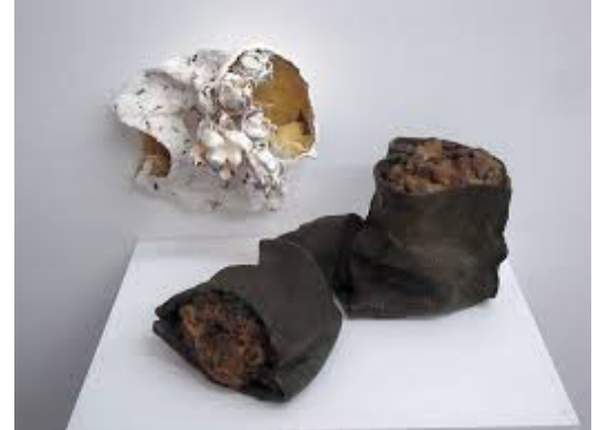
Kaneem Smith, (left to right) Reap and Sow , 2014, linen, encaustic wax, cotton bolls 4 x 5 x 3 inches; Wring Out , 2014 green cotton, burlap, encaustic wax 4 x 8 1/2 x 5 inches

Kaneem Smith's sculptural installations draw themselves from a familial and historical standpoint of personal experience and the human condition. Smith's exploration of three-dimensional form and installation incorporates deceptively subtle ideas of the exploitation of human anthropology, archeology, and American history. These concepts run a common thread throughout her body of work.