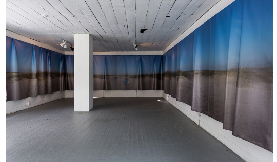
Regina Agu, Sea Change (installation view at Project Row Houses), 2016, vinyl print, 80 x 6 feet

“My work is conceptually oriented towards language, history and representation. I address these as they coalesce and intersect in contemporary ideas around the landscape and communities of color. I produce drawings, installations, photographs, performances, texts, and collaborative public projects.”