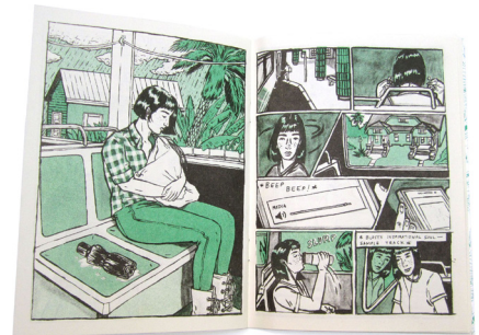
Sarah Welch, Endless Monsoon IV: Very Pleasant Transit Center , 2016, Risograph printed comic, 5 x 7 inches

Sarah Welch self-publishes comic books, zines, and prints. She regularly creates installations in tandem with her comics. These spaces are built around objects and imagery lifted from the books' narratives and function as reading rooms for viewers. Her stories chronicle the present and speculative future of the Gulf Coast with a focus on women's solidarity and climate change.