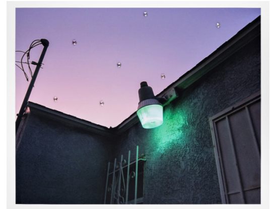
Sadie Barnette, Untitled (Purple sky stars) , 2017, archival pigment print with rhinestones, 13.5 x 16 3/4 inches.

"Whether working in drawing, photography, or large-scale installations, I turn my attention toward unexpected locations of identity construction. I engage a hybrid aesthetic of Minimalism and density, using text, glitter, and found objects to demonstrate the necessity for poetry and abstraction in urban life and the power of the personal as political. My work relishes in 'the everyday' but is also tethered to the other-worldly—an escape, and the space to imagine bigger possibilities."