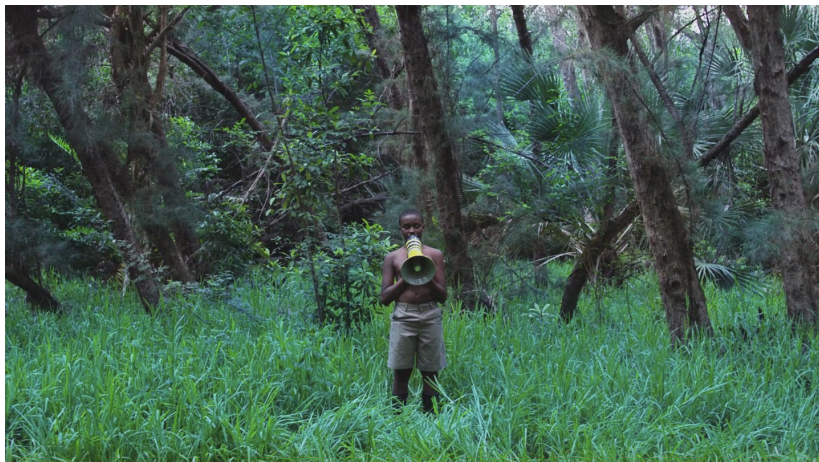
Terence Nance , Still, SWIMMING IN YOUR SKIN AGAIN , 2015, Video, 22 minutes, courtesy of the artist.