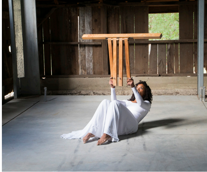
Casting II, 2017.