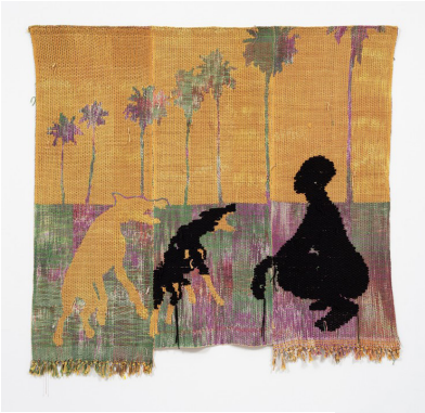
Diedrick Brackens, in the decadence of silence (2018), hand-woven cotton and acrylic yarn, 75 x 74 inches.