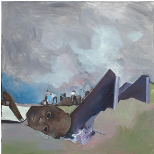
Noah Davis, "In Search of Gallerius Maximumianus" (2009), oil on canvas, 48 1/8 x 48 1/8 inches

more than 15 feet below ground on the western bank of the Nile River.