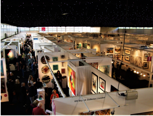
The 2018 Affordable Art Fair In Battersea Park