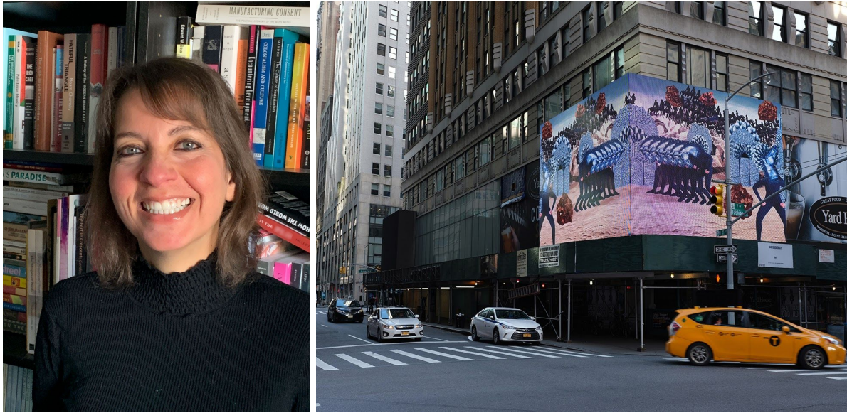
Left: Photo of Artist by Allan deSouza